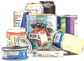
Steel, Tin & Aluminum Cans