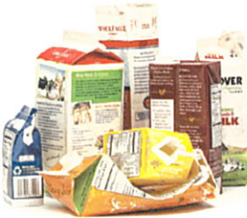
Paper Cardboard, Dairy & Juice Containers

Brown paper bags, office paper, newspaper, magazines, phonebooks