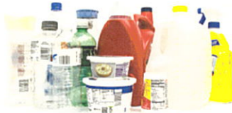
Plastic Bottles & Containers #1-7