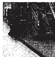
Mill and Overlay