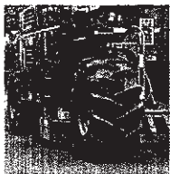
Crush and Shape

No-shows or cancellations within three business days of the session will be charged the full registration fee. Substitutions will be accepted.